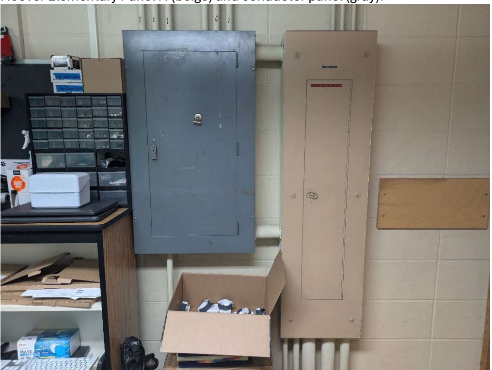
Hoover Elementary Panel H label

Hoover Elementary Panel H (beige) and conductor panel (gray).