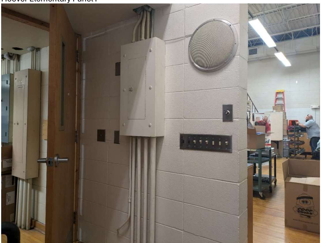
Hoover Elementary Panel I label